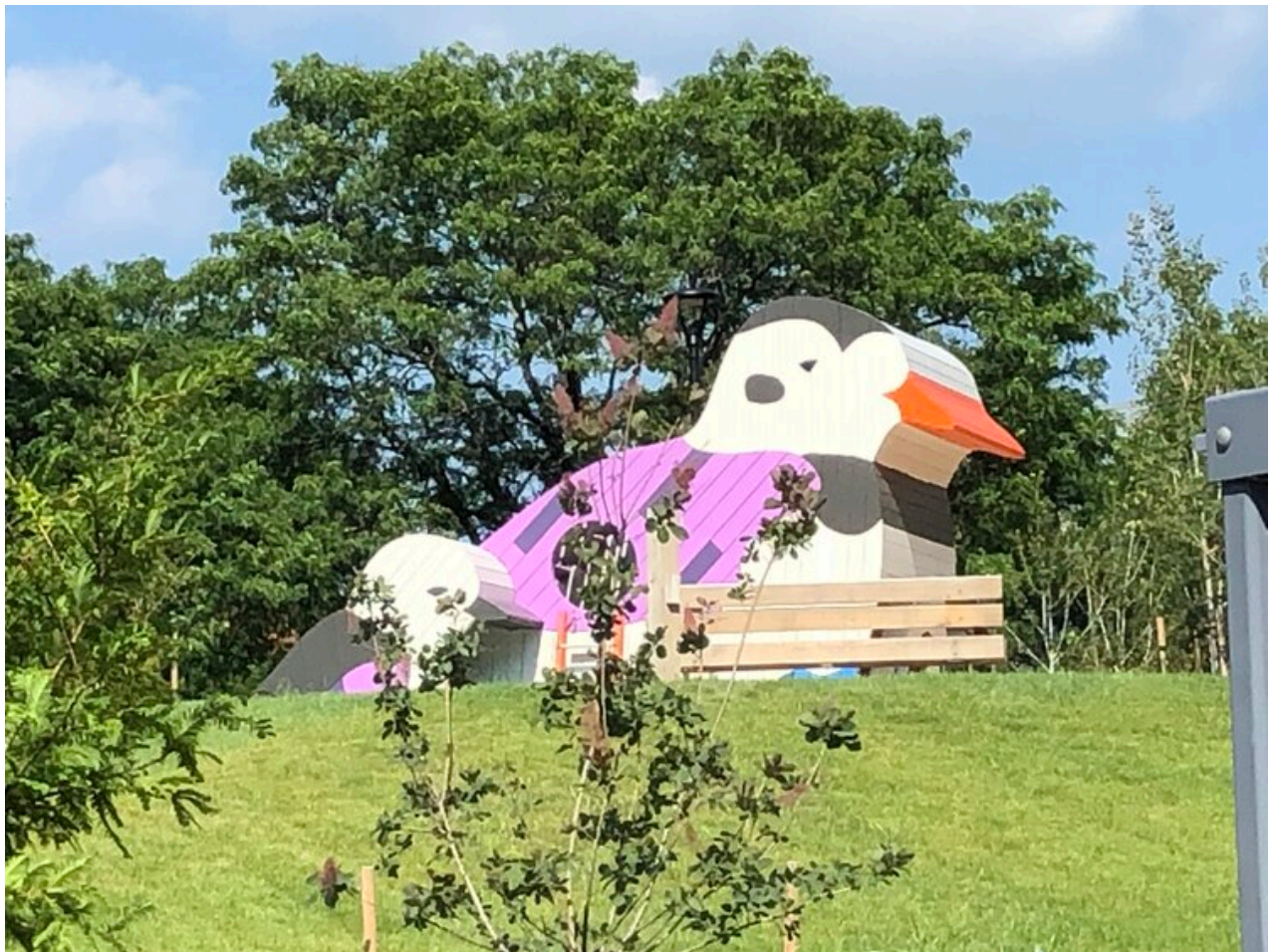
The Big Duck in the new park

New Timothy J. Toomey Park on Rogers Street between 2nd and 3rd Streets